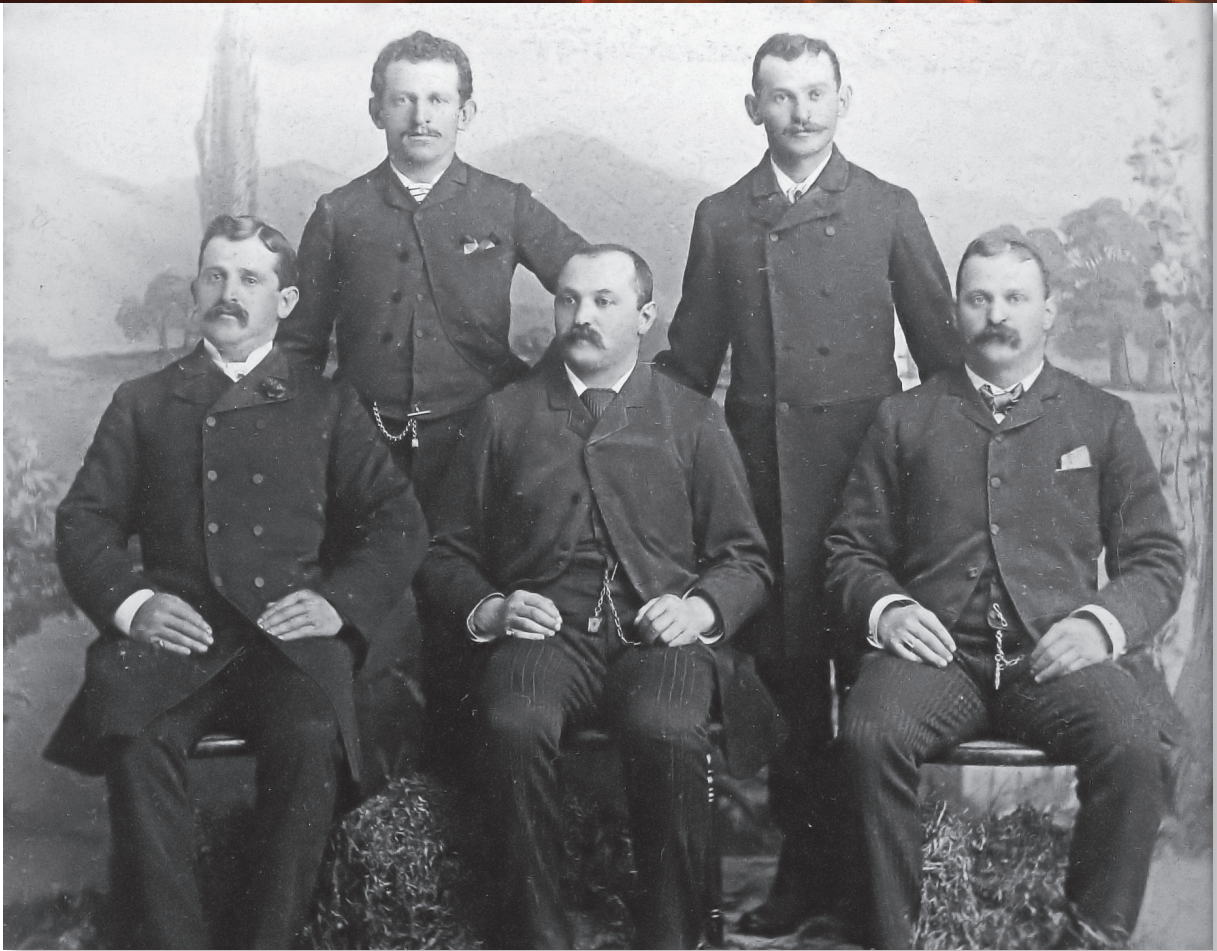
Five Levi Brothers.